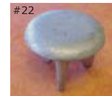
#22 Pipe End Plug