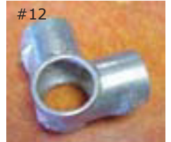
#12 Side Outlet Tee