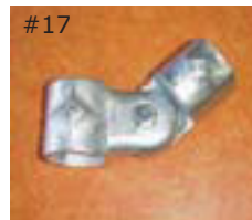
#17 Adjustable Tee