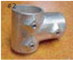
#2 Joining Tee