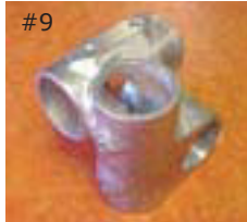
#9 Rack King