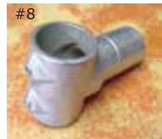
#8 Swivel Tee