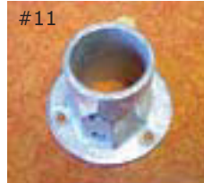
#11 Round Base Flange