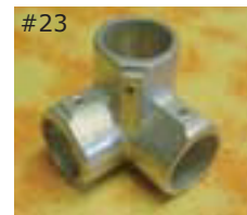
#23 3 Way Connector