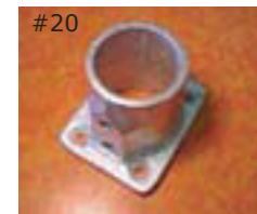
#20 Sq. Base Flange