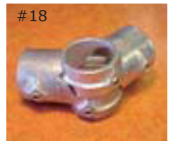
#18 Adjustable Cross