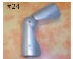
#24 180° Adj. Elbow