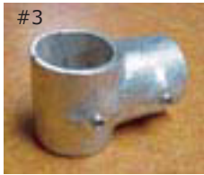
#3 Economy Tee