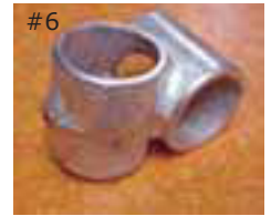
#6 Economy Crossover