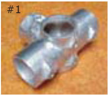
#1 Side Outlet Cross

Send us your project idea and we will break down the materials for you.