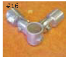
#16 Adj. 90° Corner