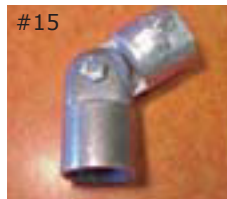
#15 Adjustable Elbow