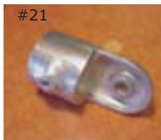
#21 Socket Swivel