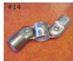
#14 Step & Landing