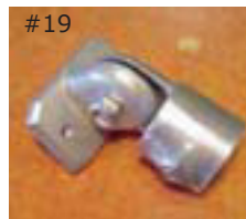
#19 Adjustable Flange