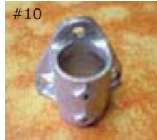
#10 Wall Flange