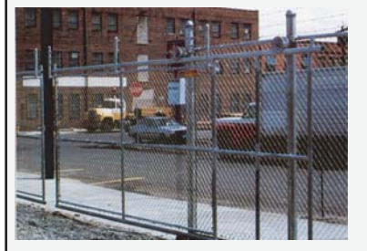
Cantilever-Type Slide Gate Affords easy access while minimizing space loss.