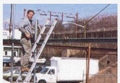
Overhead Beam Gate